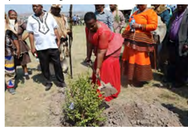
Mayor planting a tree