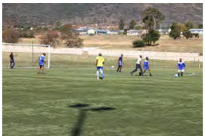
Uyaqhuba umdlala wabantu abadala

Ngomhla weshumi kwinyanga yeThupha, nalapho uSodolophu woMasipala wasekuhlaleni Umzimvubu, kwakunye nesigqeba salomasipala, ethe waqhuba inqubo yokhuphiswano lwezemidlalo, nebizwa ngeTumente kaSodolophu yabantu abadala 'I-Elderly Mayoral Cup Tournament '. Le midlalo iquka ibhola yomnyazi kwakunye nebhola ekhatywayo, nezithezaqhuba