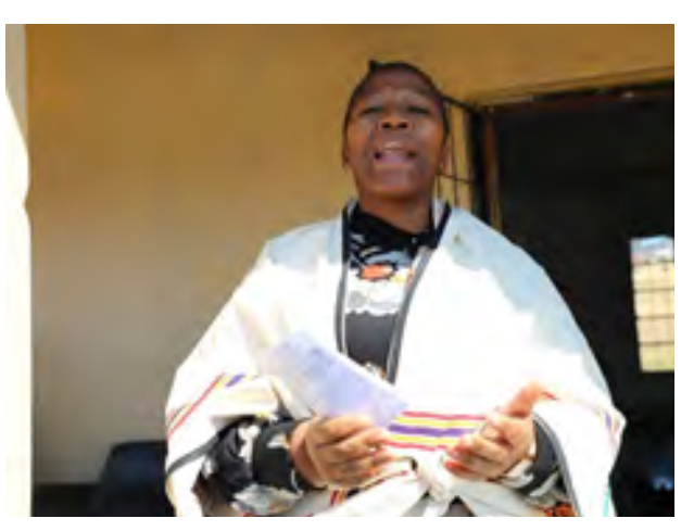
Usodolophu esothula ingxelo yosuku

wamashumi sithathu kwinyanga yeThupha, uSodowalo Masipala, isigqeba sakhe nenkonzo yesipolisa kwakunye bandwendwela\,ikomkhulu\,lama Xesibe\,kwaward\,2.