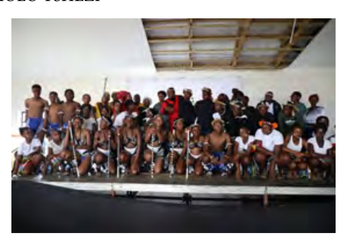
Amaghela omxhentso ebezimase umsitho