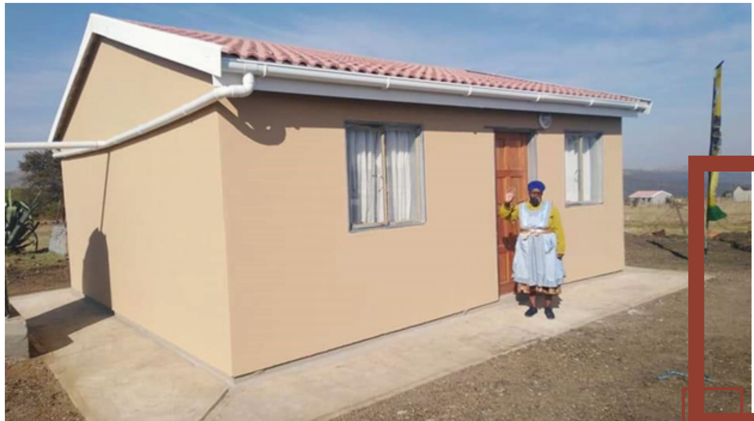
Rhode Beneficiary Poses Infront of Her New RDP Home

APRIL - JUNE 2020 NEWS EDITION | UPHUHLISO KUMNTU WONKE